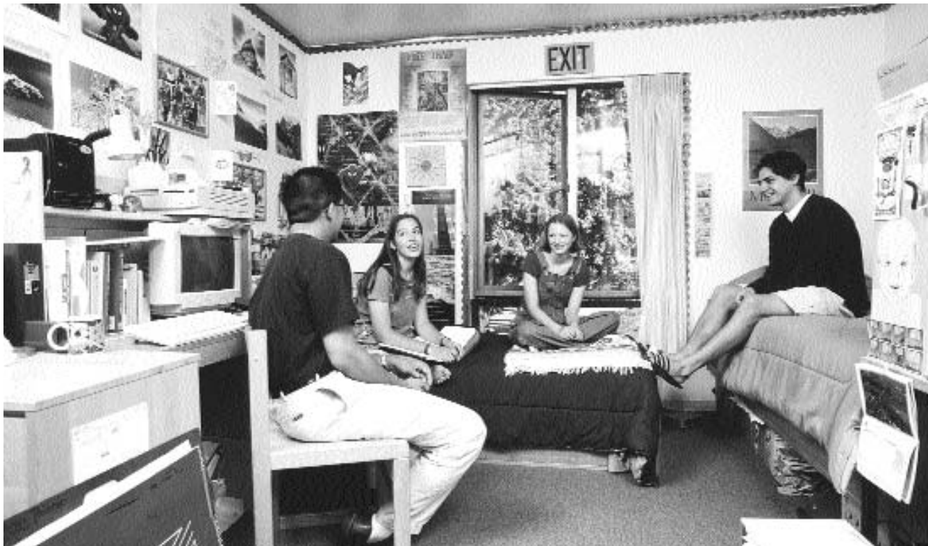
UCSC offers two kinds of residential living on campus—residence halls and apartments. Shown above is a typical residence-hall room, available in all of the ten residential colleges except Kresge College; Kresge has apartments only.

various kinds: lectures and presentations by local faculty and visiting scholars, theatrical and musical performances, and forums and debates on topics of current interest.